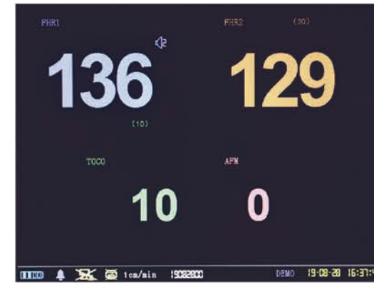
Big font interface