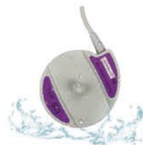
Water Proof IPX4