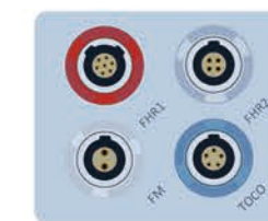
FHR1 | FHR2 | FM | TOCO