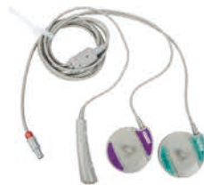
3 in 1